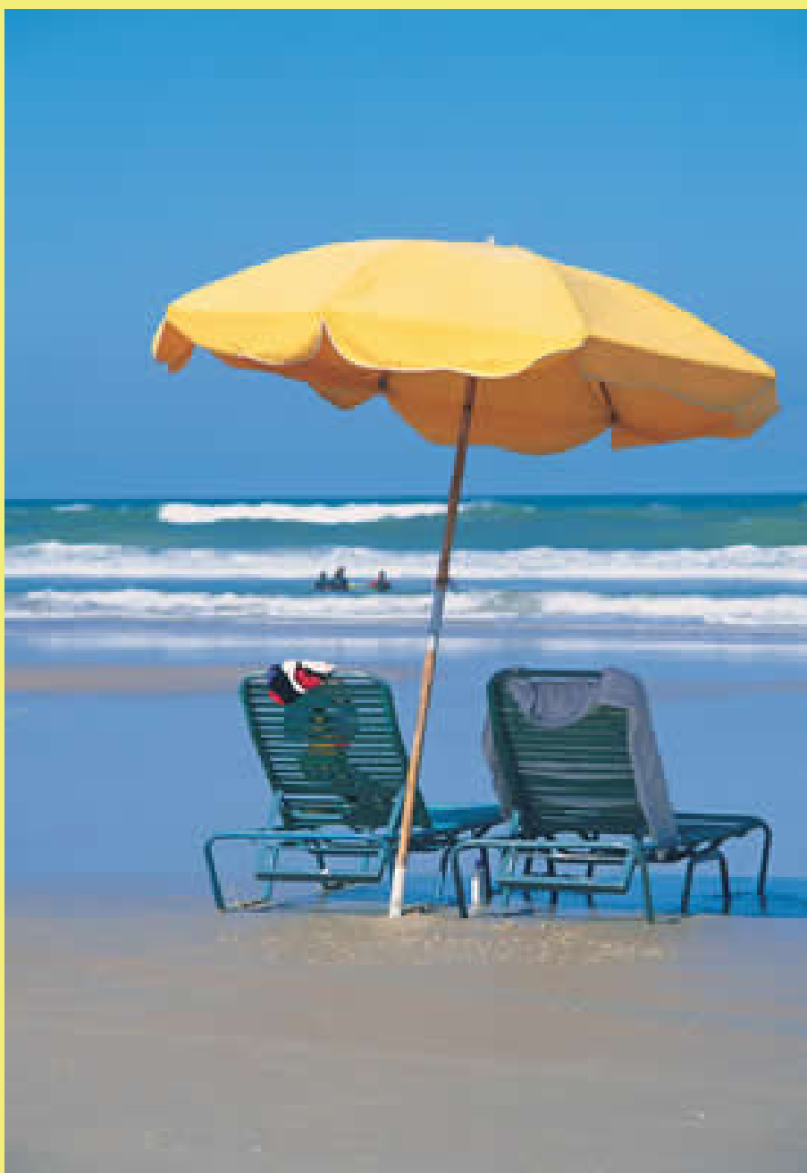
Your Favorite Place To Relax...SEAHAWK INN & VILLAS